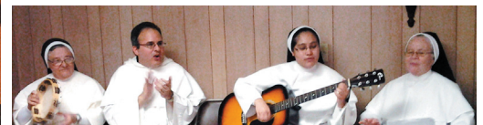
Our Sisters (and chaplain) from Puerto Rico, entertain us with songs about St. Dominic.