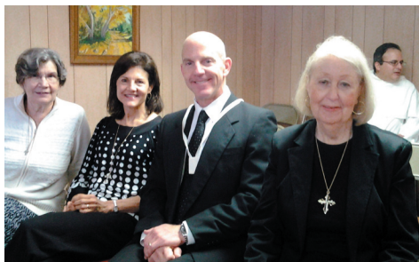
Some of our lay Dominicans